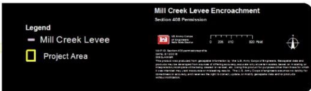
Figure 2. Location of building encroachment